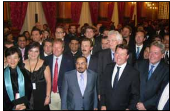
Opening ceremony by Christian Estrosi, Member of Parliament and Mayor of Nice, Former Minister of Industry for the delegates at the Palais des Rois Sardes.