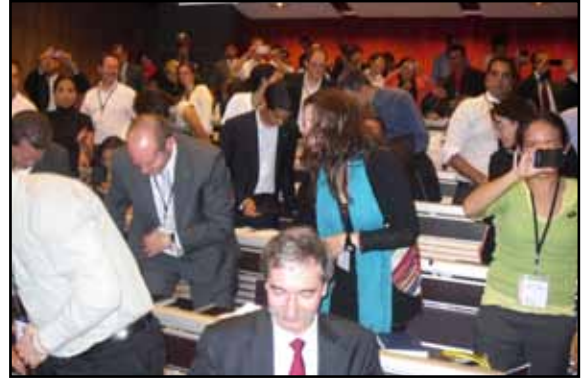
A big thank you for the G20 YES Organisers.