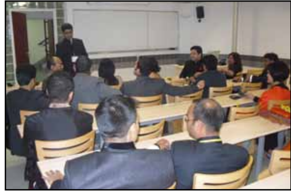
Strategic meeting on India's stand before the start.