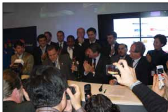
The signing of the charter in the presence of Mayor of Nice.