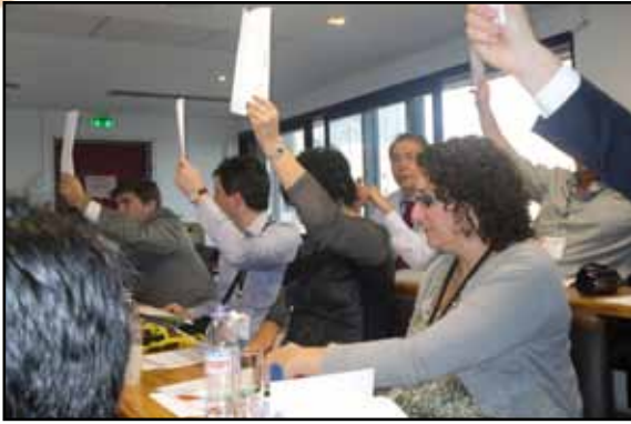
Delegates voting for and against the listed out points.