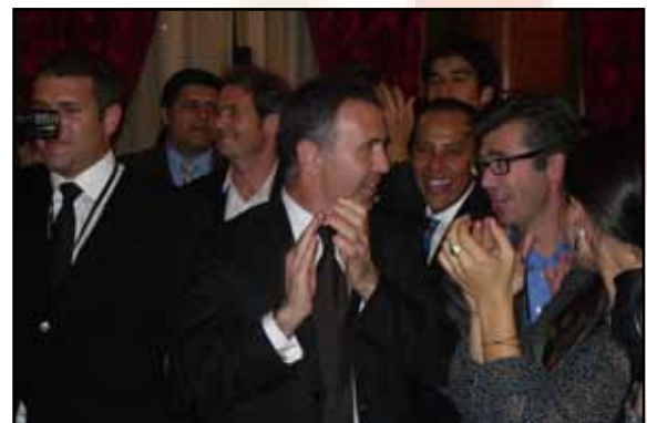
Representatives of G20 Summit across various countries receiving the Indian delegation with a loud applause.