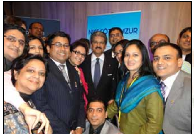
The Indian delegation with Professor Muhammad Yunus, Economist, Founder of Grameen Bank, Bangladesh and Nobel Peace Prize Laureate.