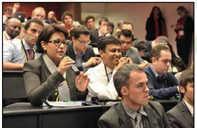
Members of the Indian delegation posing questions and interacting with the panelists.