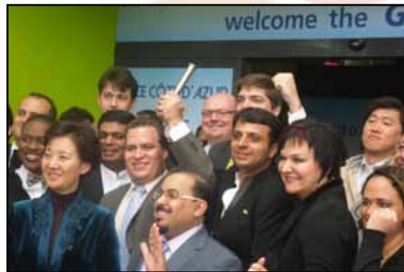
The Indian and Mexican delegation receiving the baton.