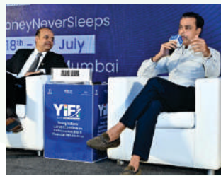
Shri Milind Deora