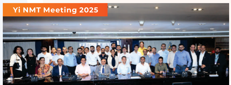
Yi NMT Meeting 2025