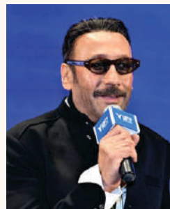
Mr. Jackie Shroff