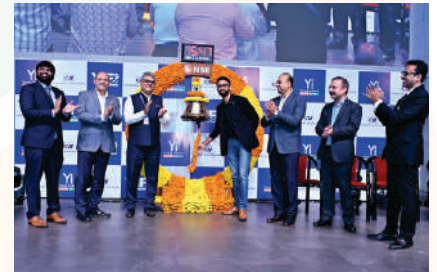
A Symbolic Ring for an Enterprising Bharat