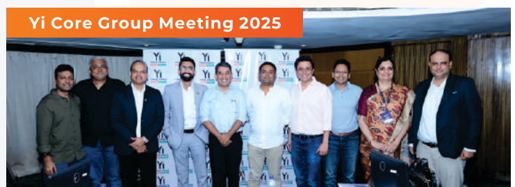
Yi Core Group Meeting 2025