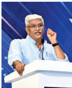
Shri Gajendra Singh Shekhawat