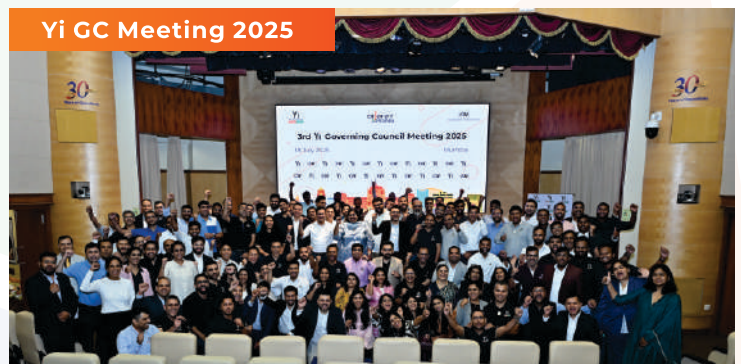
Yi GC Meeting 2025