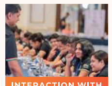
INTERACTION WITH Yi LEADERS