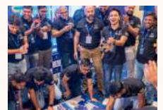
FELLOWSHIP & BONDING