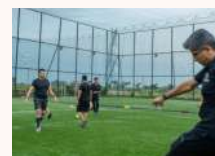
SPORTS & TEAM BUILDING