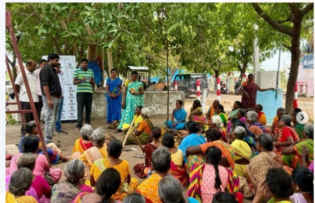
OnePlus Nord 4 25 July 2025 at 17:46